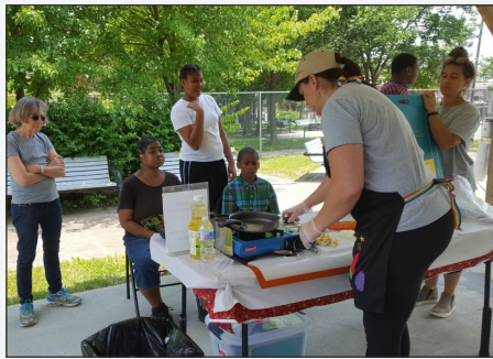
A live food demonstration with the fresh food grown in the city of Chester